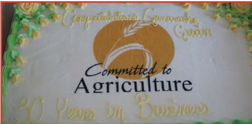
Photograph taken from the Ganaraska Grain Ltd. website at: www.ganaraskagrains.com/index.cfm

The Port Hope & District Chamber of Commerce would like to extend their sincere best wishes and congratulations to Ganaraska Grain Ltd. on their 30 years of business that was recognized on July 22nd 2011.